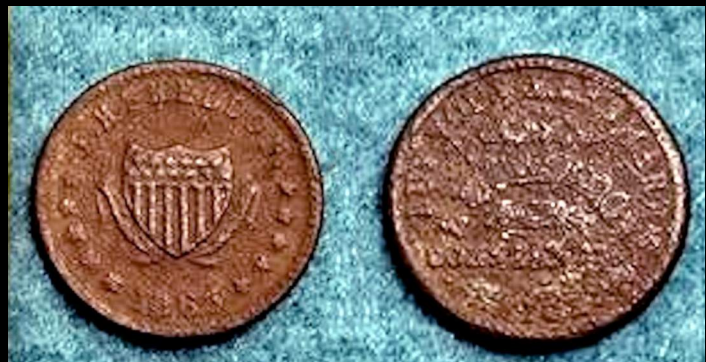
FOB, BADGE, TOKEN